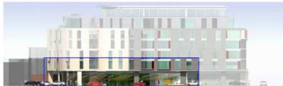
Cavendish road elevation - Library