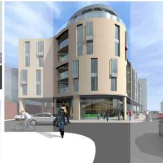
A View towards the proposed library entrance