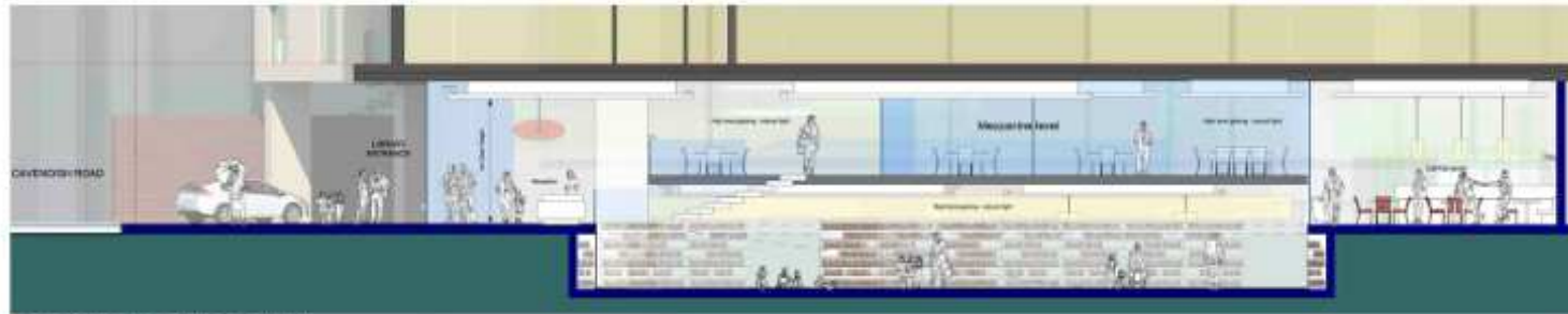
Long section through Library (B-B)