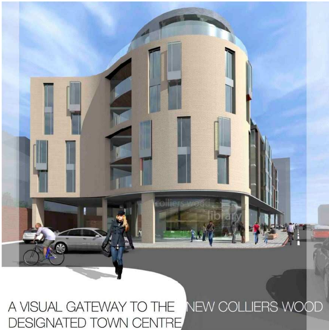
A VISUAL GATEWAY TO THE NEW COLLIERS WOOD DESIGNATED TOWN CENTRE